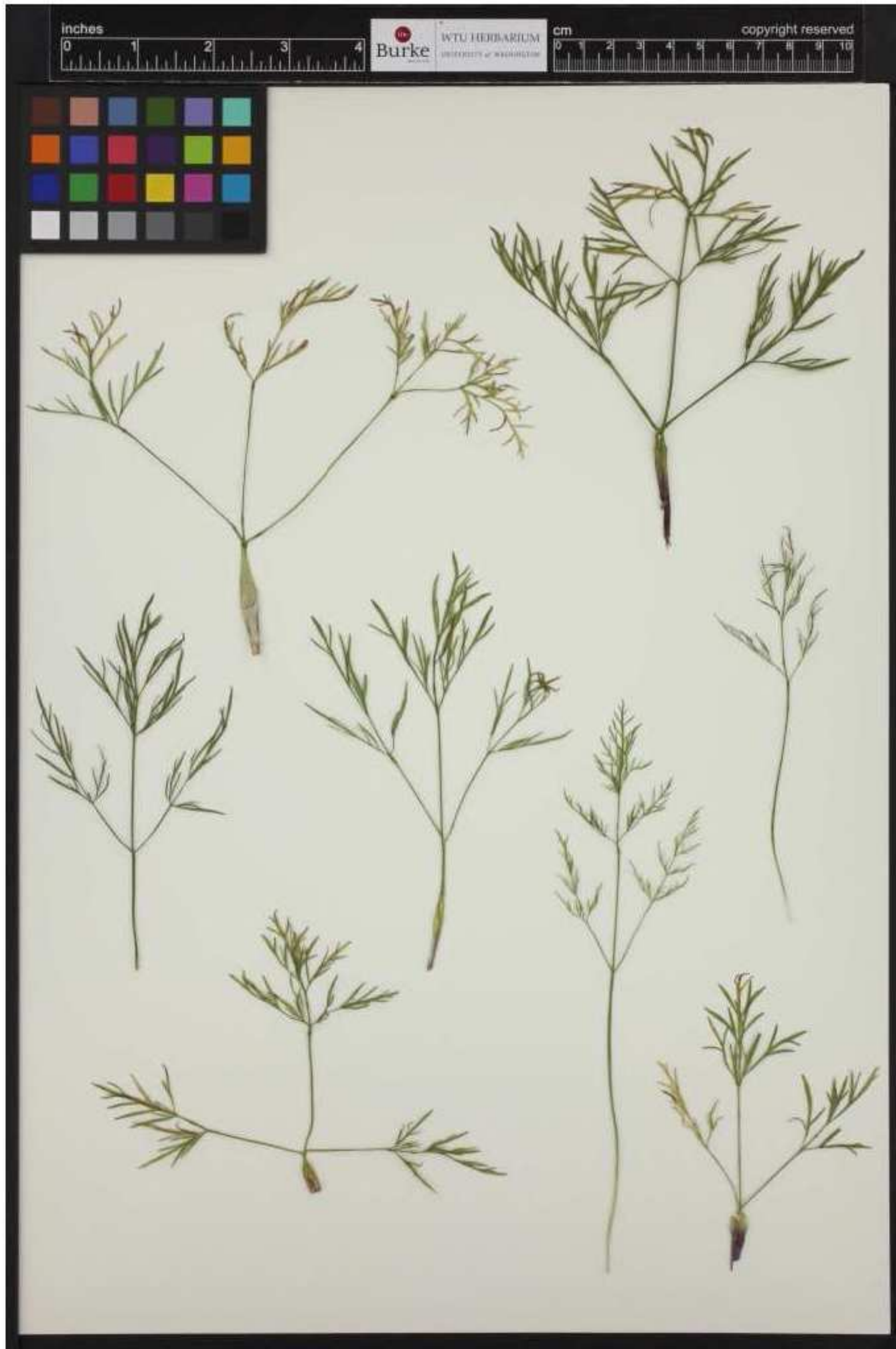
Figure 3. Lomatium knokei leaves depicting the range of variation of leaf morphology typical for the species. Those leaves shown with broad petiole bases are primary while those lacking this feature are axial leaves that arise from inside the broad petiole bases of the primary leaves.